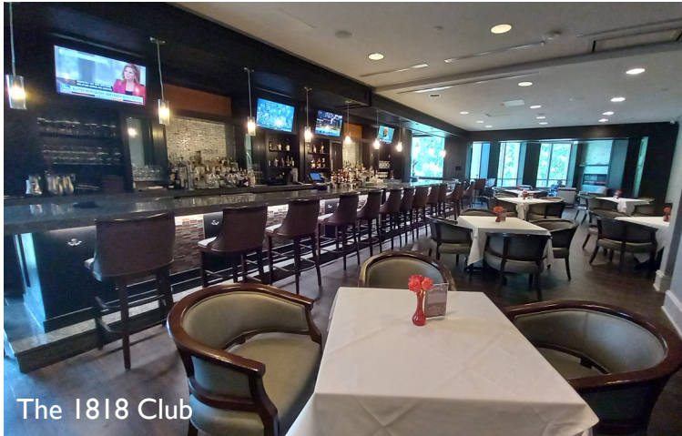
The 1818 Club

6500 SUGARLOAF PARKWAY, DULUTH, GA 30097