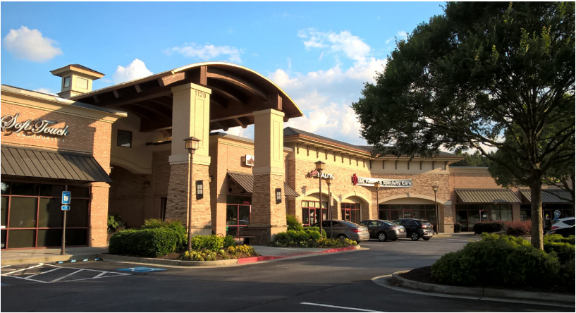
Coming Soon: Jam & Toast Cafe

1120 PEACHTREE INDUSTRIAL BOULEVARD, SUWANEE, GA 30024