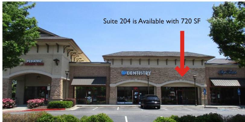
Northside Suwanee Health Center is expanding