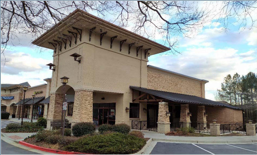
Beautiful large patio area, most is covered

Shoppes at Suwanee, 1120 Peachtree Industrial Blvd., Suwanee, GA 30024