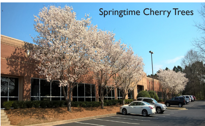
Springtime Cherry Trees