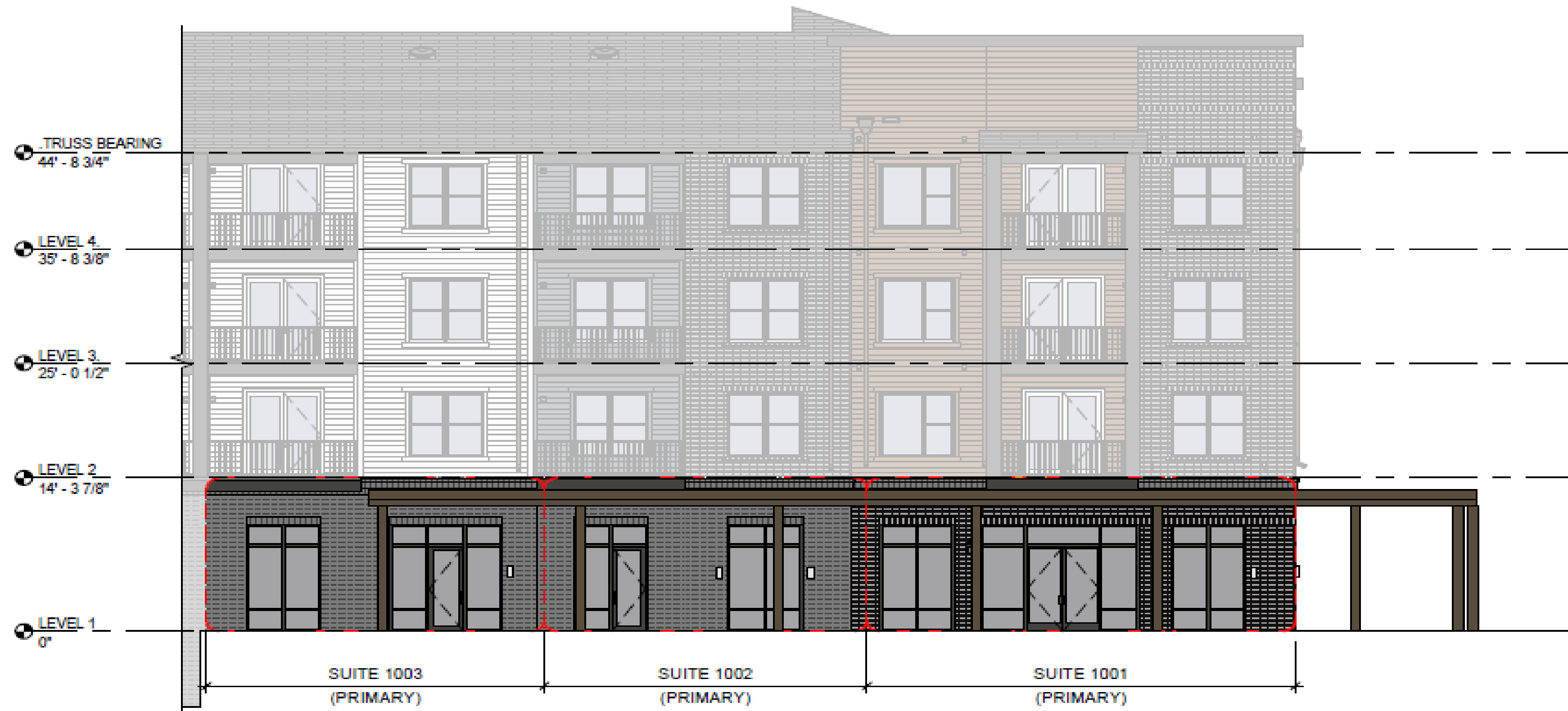
1 3/32" = 1'-0" BLDG A - NORTH ELEVATION - RETAIL