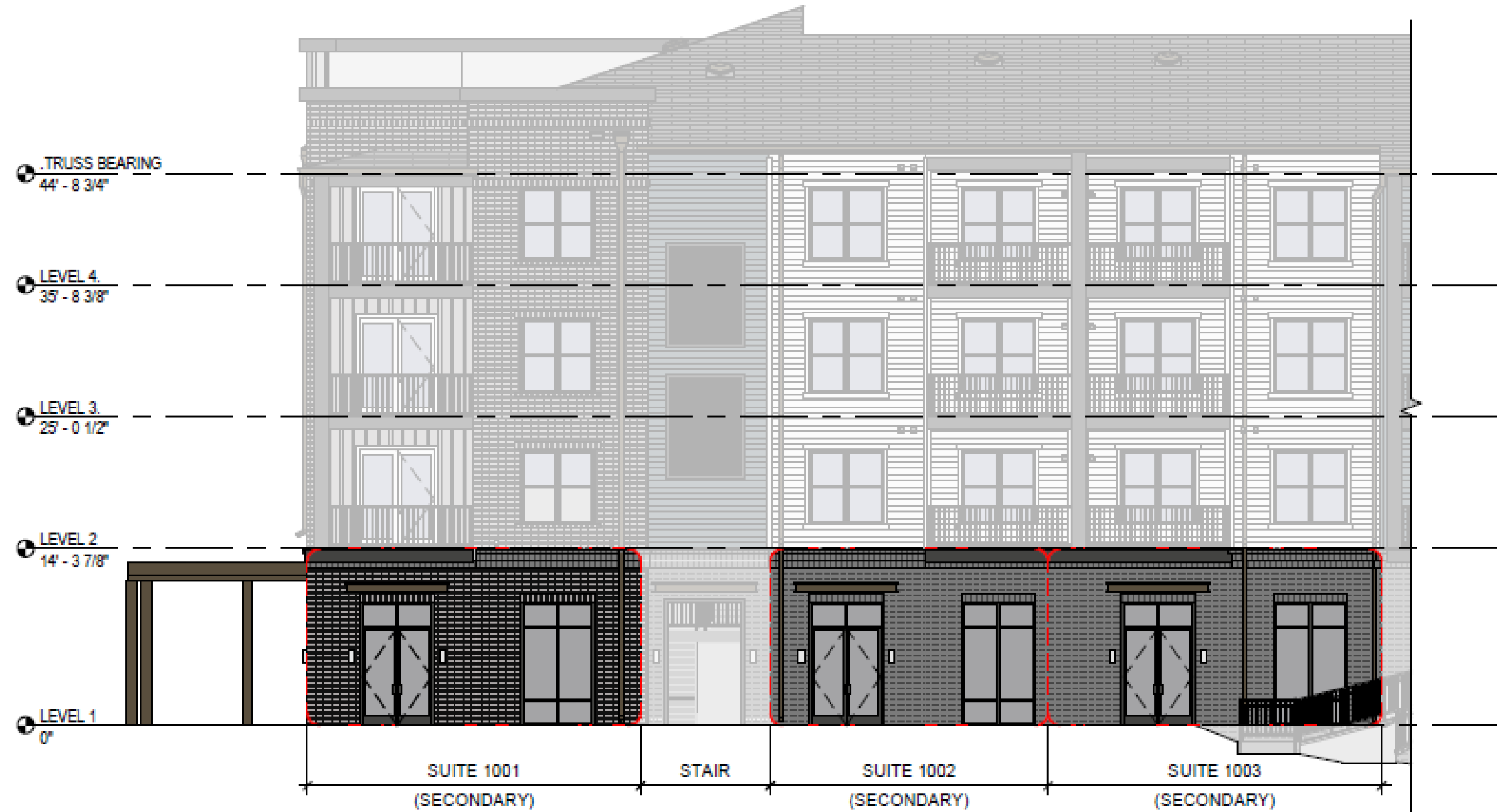
1 3/32" = 1'-0" BLDG A - SOUTH ELEVATION - RETAIL