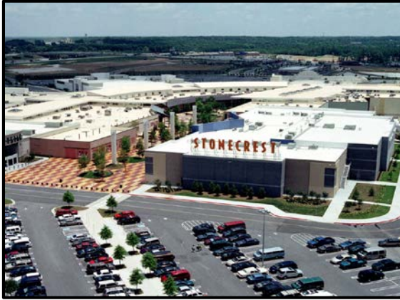
The Mall at Stonecrest