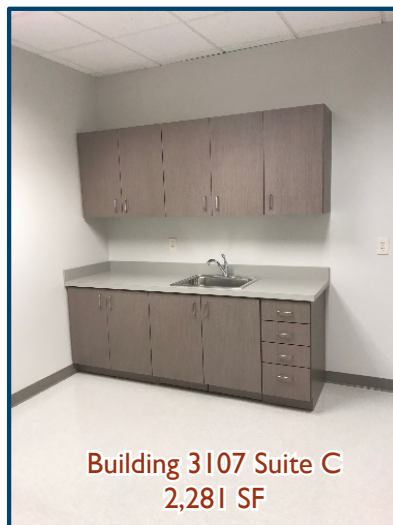
Building 3107 Suite C 2,281 SF